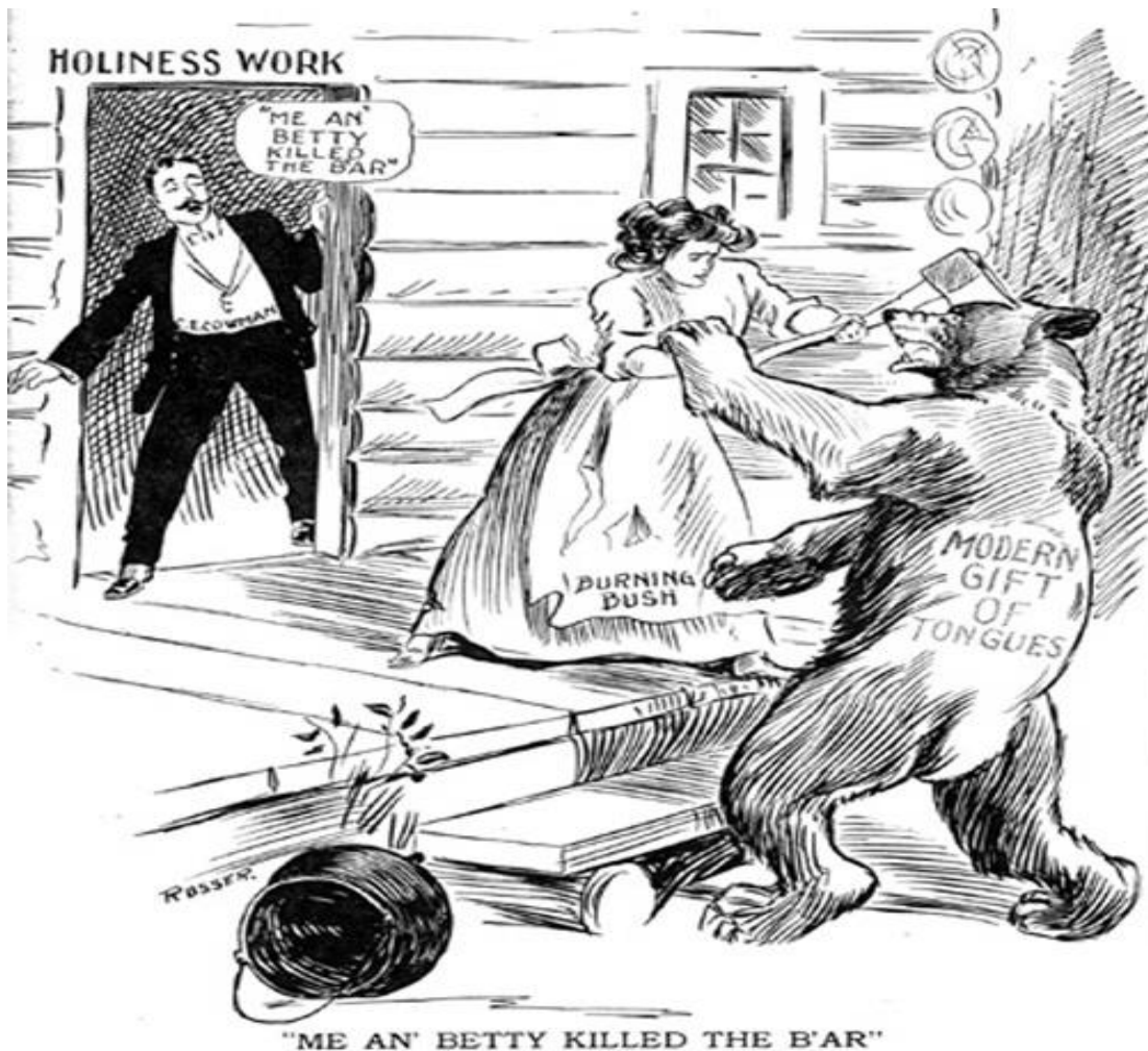
These cartoons show the reaction to the Pentecostal doctrine